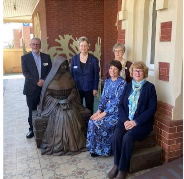
Trustee Directors and Ursula Frayne at Mercedes College.