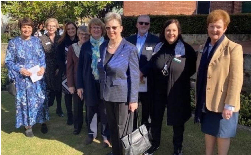
Touring Mercedes College and the convent site.