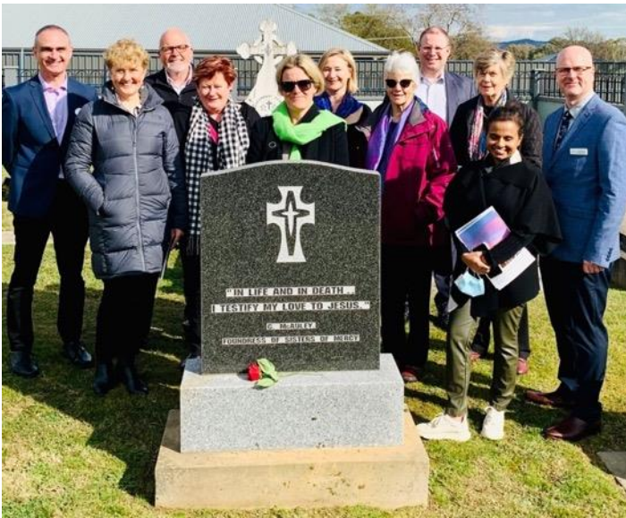
Attendees enjoyed a reflective walk to the heritage-listed cemetery.

Attendees enjoyed a reflective walk to the heritage-listed cemetery, and site visits to the construction site of the new transition and assessment facility (Basil House), and to the proposed site of a planned Community Inclusion facility. They then had the opportunity to visit the newest accommodation facilities at Waratah Place and Acacia House, where they met with Mercy Connect staff and residents.