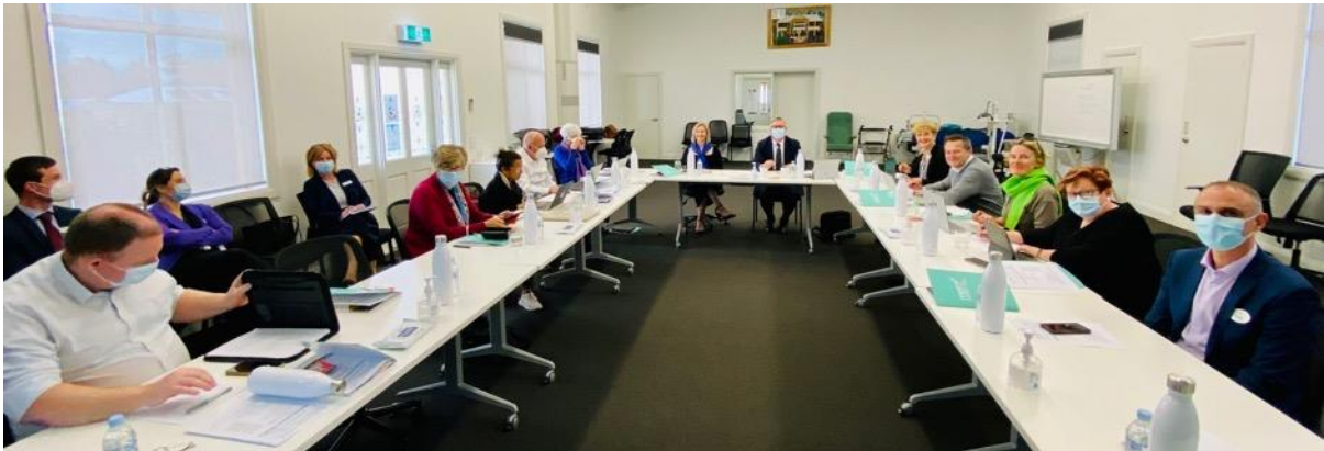
MCSAL Board Meeting.

Mercy Connect welcomed Mercy Community Services Australia (MCSAL) Directors and other Ministry CEOs to their St John's Campus in Albury, where they hosted the monthly MCSAL Board Meeting on 6 September.