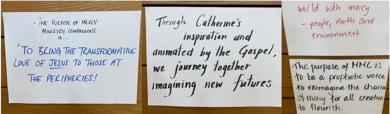
Crafting the MMC story.