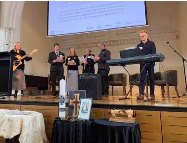
MMC Conference Choir.