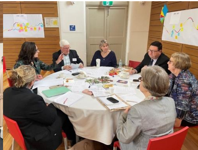
Participants hard at work.