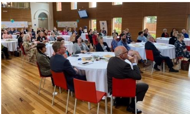
Participants enjoying one of the many presentations throughout the conference program.